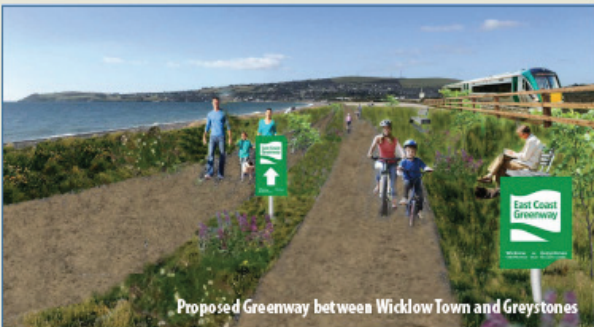
Proposed Greenway between Wicklow Town and Greystones