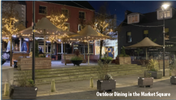
Outdoor Dining in the Market Square