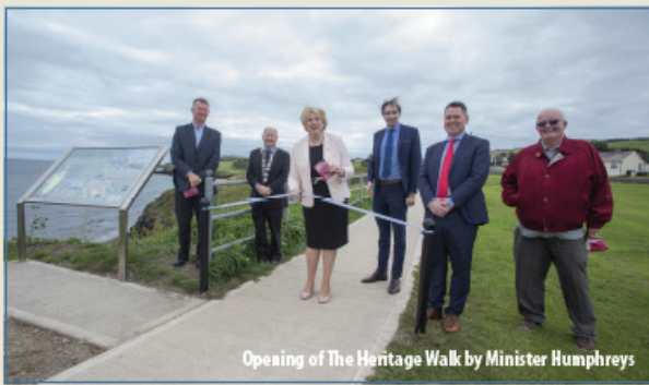
Opening of The Heritage Walk by Minister Humphreys